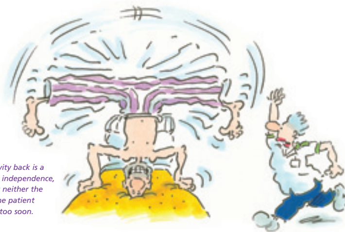
Whilst getting activity back is a great step towards independence, it is important that neither the nursing staff nor the patient attempt too much too soon.

This range of problems mean that when patients are discharged back to general ward they may still require a high degree of nursing intervention and support to meet their basic needs, such as washing, dressing and feeding themselves. Whilst patients struggle to regain some degree of 'normality' it is important ward staff and family members show patience and give reassurance.