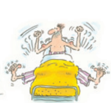
As activity increases (muscle) weakness and joint stiffness will improve.

with nursing/medical staff so that these can be monitored, as these symptoms can be due to a post – traumatic stress response that may require treatment.