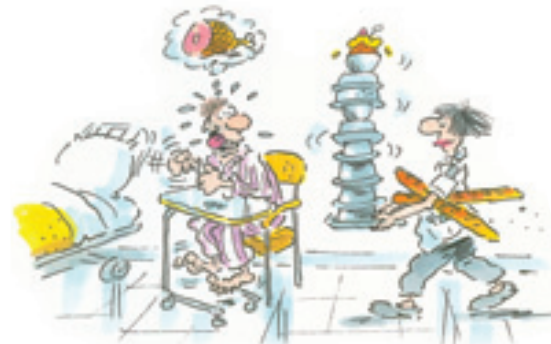
You will notice your appetite slowly getting back to normal.