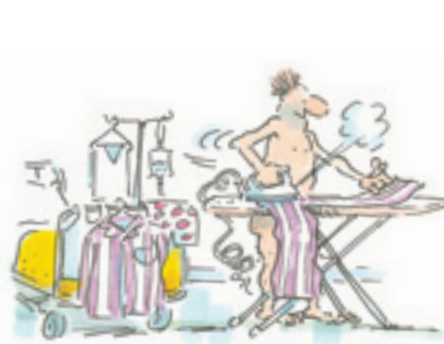
You will gradually get some independence back along with the ability to self care.

Some patients may suffer from the psychological effects of a critical illness and a change in mood is not unusual. Some may find their mood is low or depressed; anxiety and panic attacks are also common as a result of the traumatic experience they have been through. Sudden or unaccountable changes in mood should be shared ►